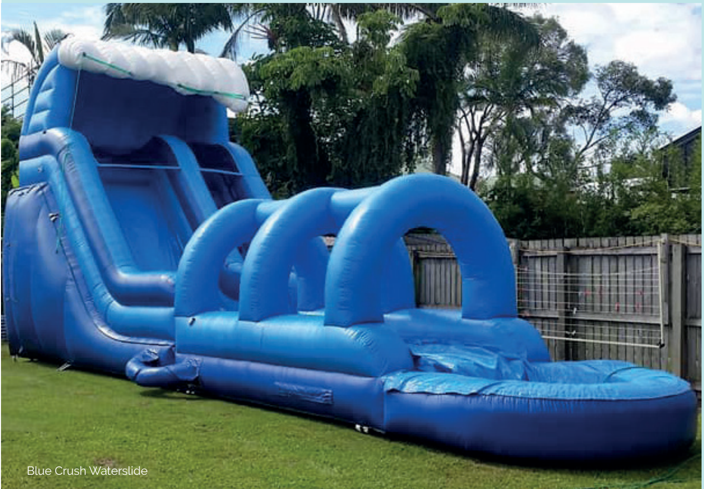
Blue Crush Waterslide

If all inflatables are hired out for full day sessions on both the Saturday and Sunday your take home cash for the weekend is $2730 (can be higher if 2 half days of each castle are booked per day) your only weekly expense from this amount is fuel.