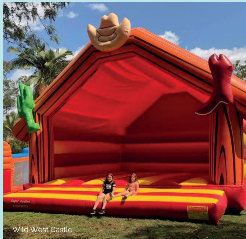
Wild West Castle

These Packages are Business opportunities; they also can be purchased as a franchise with legal documents for an additional $6000 to cover legal costs