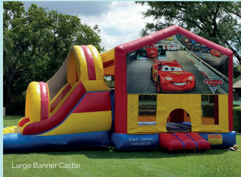
Large Banner Castle

2 Large Banner Castles 2 Small Banner Castles White Wedding Castle 40 Banners Train Obstacle Unicorn Fully Themed Castle Backyard Surfer Sign Written 8x5 Trailer 12 Blowers Sand Bag Covers Matting Pegs Trolley