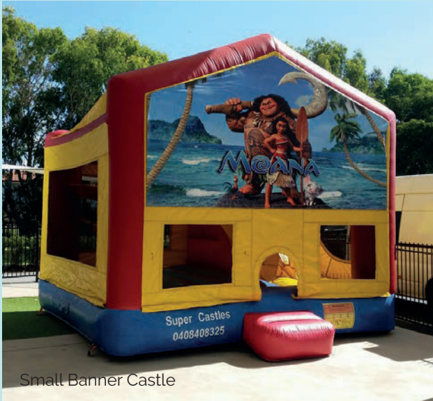
Small Banner Castle