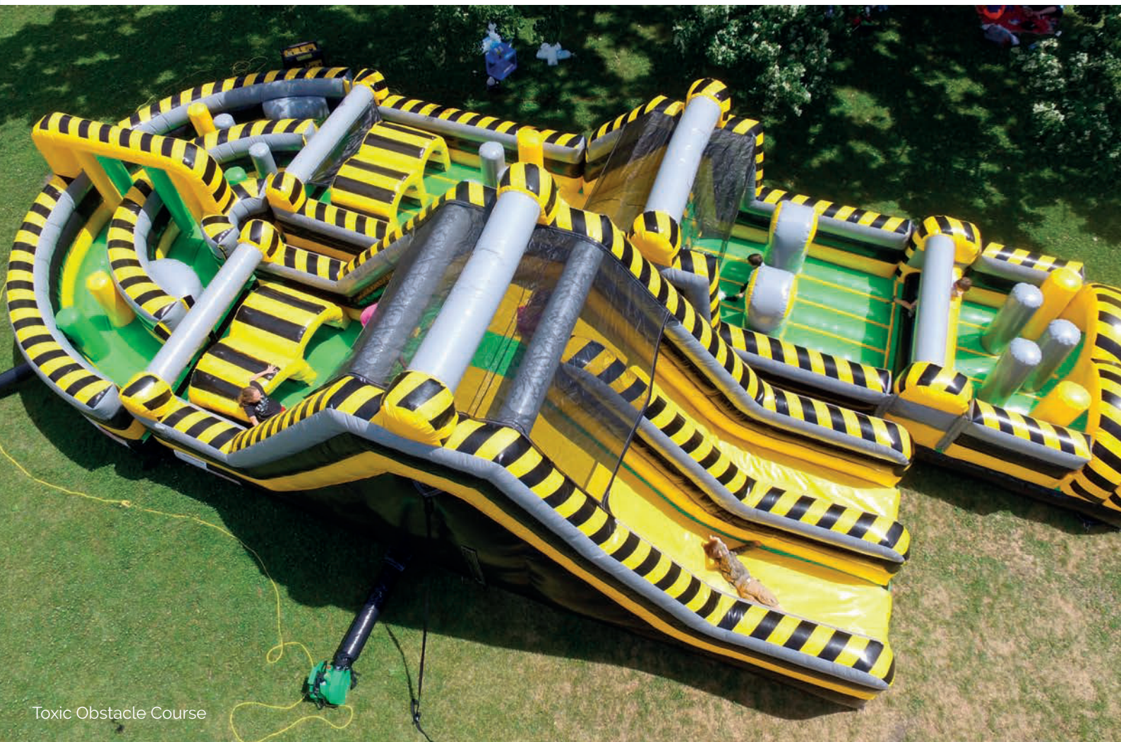
Toxic Obstacle Course